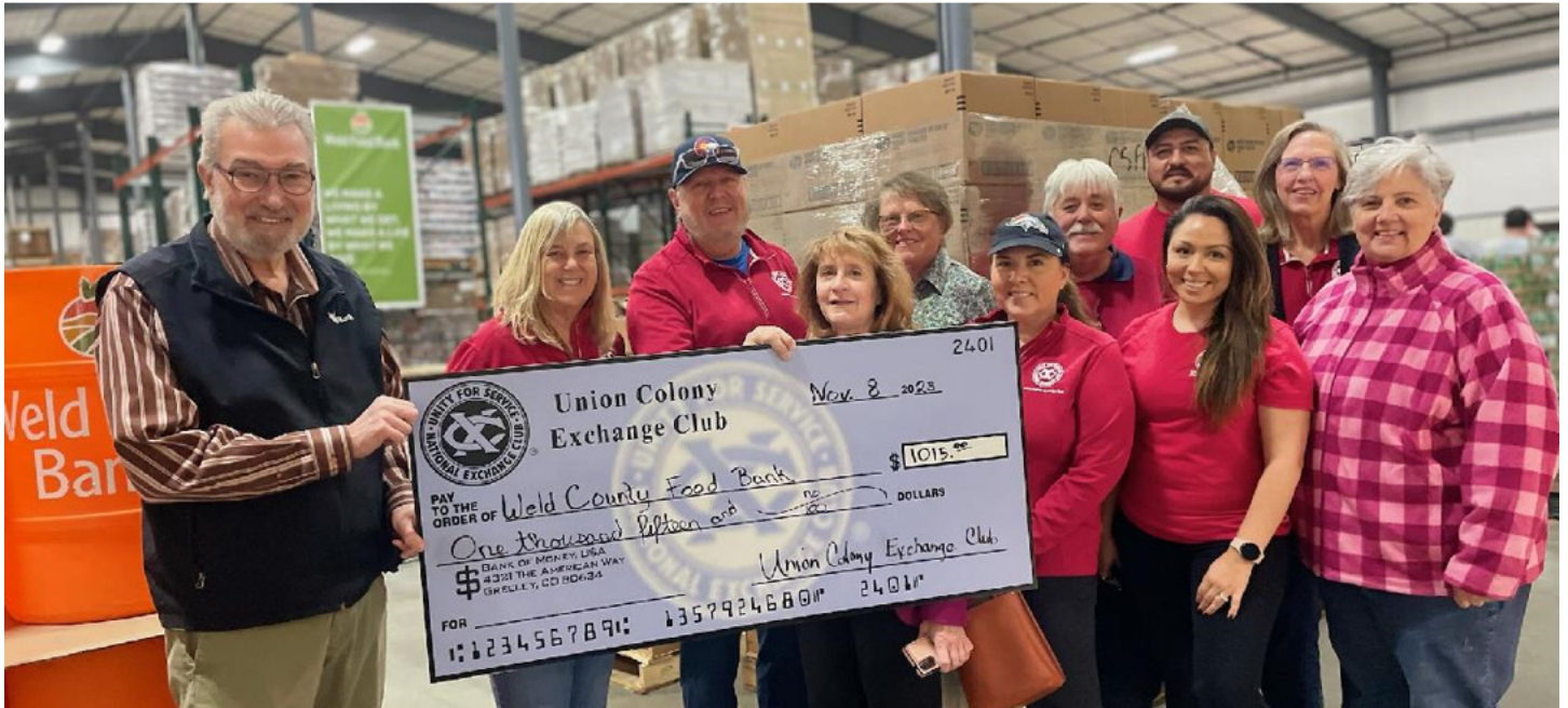
Members from the UCXC presented the Weld Food Bank a check for $1015.

We will have our 2023 Christmas Party at 477 Distilling on December 4 th starting at 630. There will be an Ugly Sweater contest and an Ornament Exchange that night.