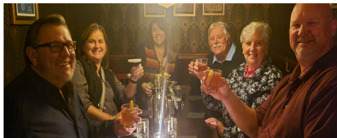
Some UCXC members attended the Beaujolais Nouveau to support the Weld Food Bank.