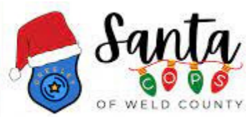
Members of UCXC helped wrap gifts for Santa Cops.